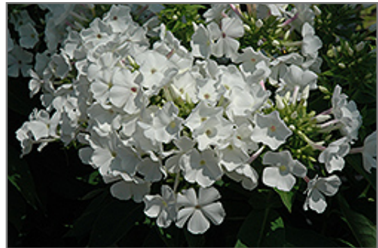
Flame White Garden Phlox flowers