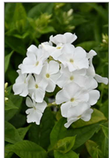
Flame White Garden Phlox flowers