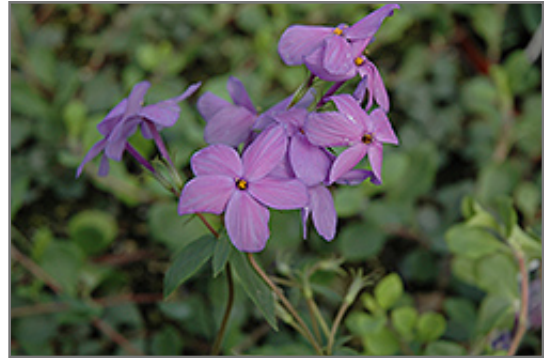
Sherwood Purple Woodland Phlox flowers