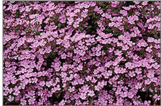
Home Fires Woodland Phlox flowers