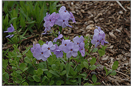
Blue Ridge Woodland Phlox flowers