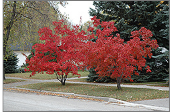
Flame Amur Maple in fall