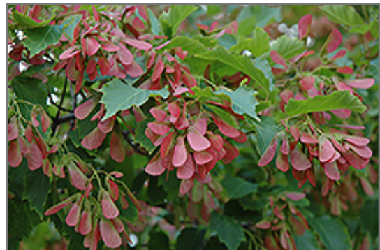
Flame Amur Maple fruit