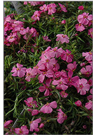
Millstream Daphne Moss Phlox flowers