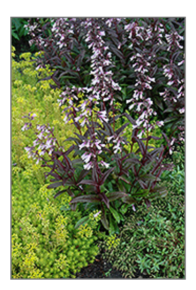
Dark Towers Beard Tongue in bloom