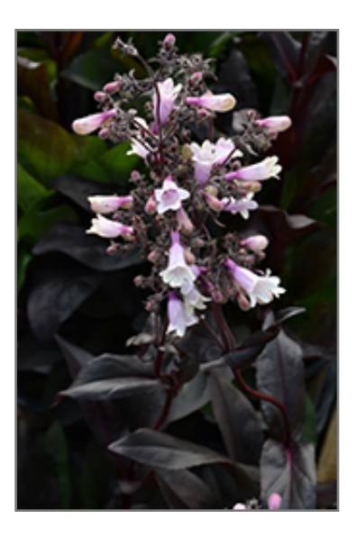
Dark Towers Beard Tongue flowers