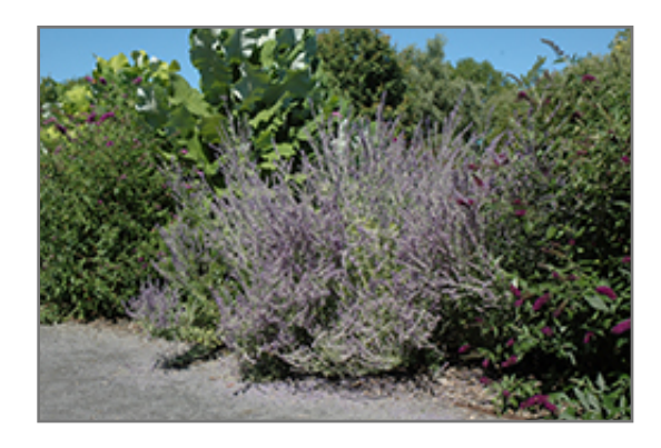
Longin Russian Sage in bloom