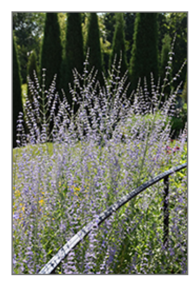
Longin Russian Sage flowers