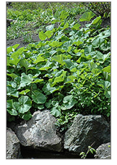
Japanese Butterbur

Truly exotic in character with large leaves making this Asian import an interesting addition to the bog or moist shade garden; large leaves give it an almost prehistoric appeal