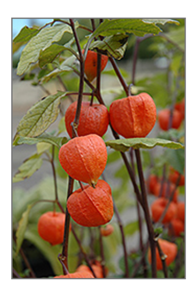
Chinese Lantern fruit