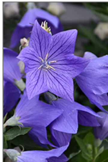
Sentimental Blue Balloon Flower flowers

Sentimental Blue Balloon Flower is recommended for the following landscape applications;