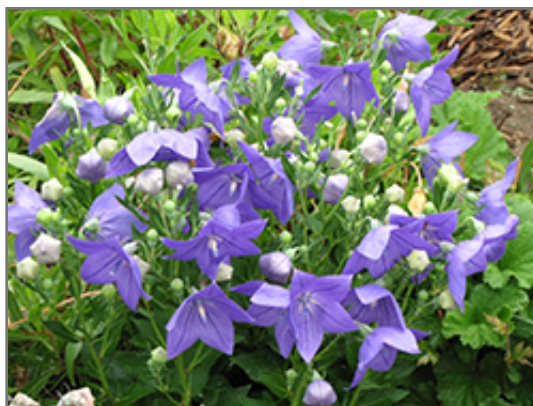
Sentimental Blue Balloon Flower in bloom