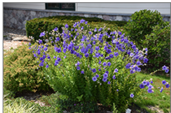
Astra Double Blue Balloon Flower in bloom