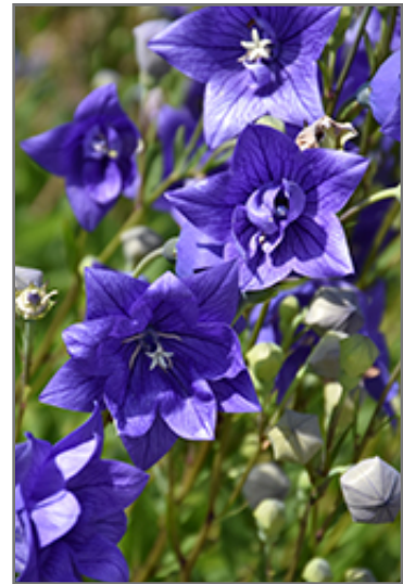
Astra Double Blue Balloon Flower flowers

Astra Double Blue Balloon Flower is recommended for the following landscape applications;