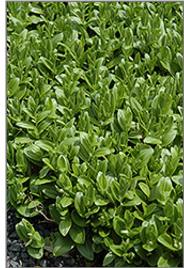
Solomon's Seal foliage