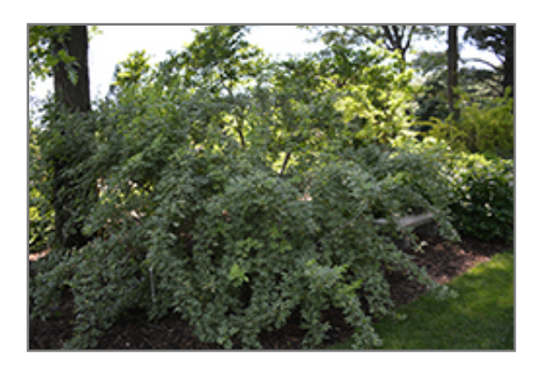
Variegated Fiveleaf Aralia

This shrub will require occasional maintenance and upkeep, and can be pruned at anytime. Gardeners should be aware of the following characteristic(s) that may warrant special consideration;