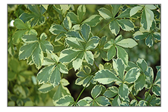
Variegated Fiveleaf Aralia foliage

The Variegated Fiveleaf Aralia is a multi-stemmed deciduous shrub with an upright spreading habit of growth. Its average texture blends into the landscape, but can be balanced by one or two finer or coarser trees or shrubs for an effective composition.