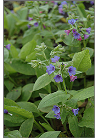
St. Ann's Lungwort flowers

St. Ann's Lungwort features delicate clusters of blue bell-shaped flowers with violet overtones at the ends of the stems from mid to late spring, which emerge from distinctive purple flower buds. Its attractive tomentose narrow leaves remain green in colour throughout the season.