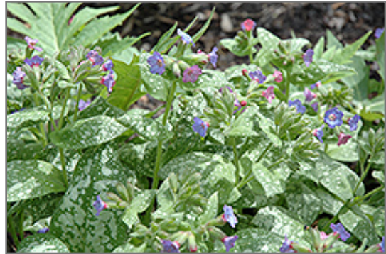
Paul Aden Lungwort flowers

Other Names: Lords And Ladies, Bethlehem Sage