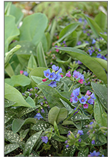
Little Star Lungwort flowers