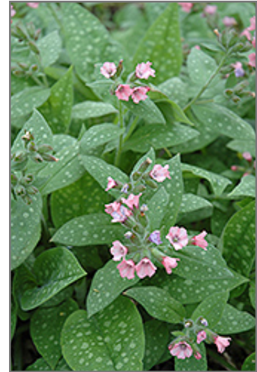
Dordogne Lungwort flowers