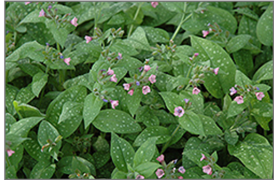
Bielefeld Pink Lungwort flowers