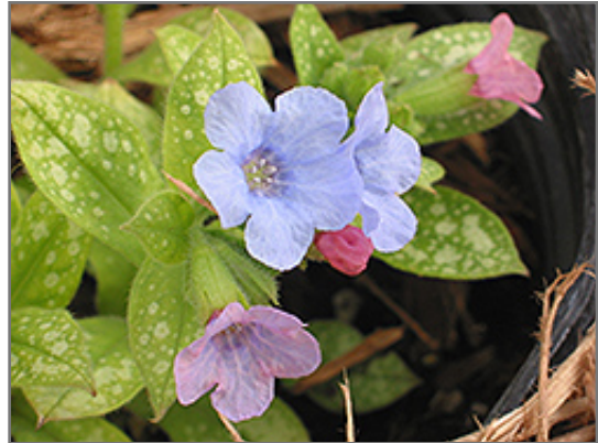
Baby Blue Lungwort flowers