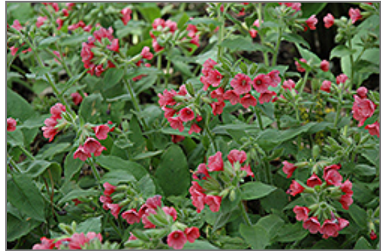
Salmon Glow Lungwort flowers