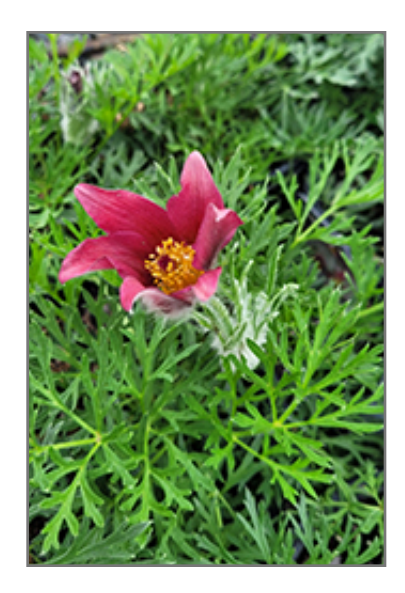
Red Pasqueflower flowers