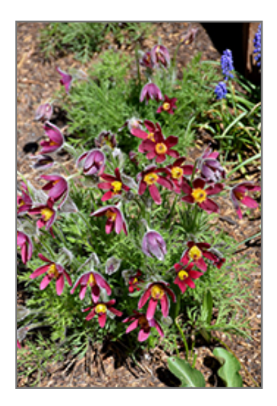
Red Pasqueflower in bloom

Red Pasqueflower is recommended for the following landscape applications;