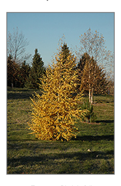
European Birch in fall