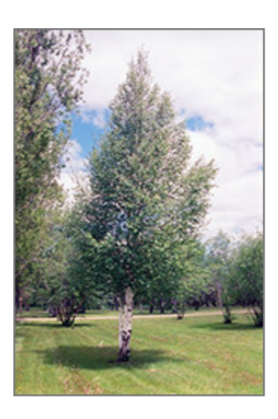
European Birch