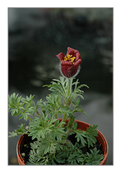
Red Bells Pasqueflower flowers

An early blooming rock garden plant with bright red blossoms held closely over delicately pubescent mounds of feathery leaves; suitable for rockeries and dry gardens