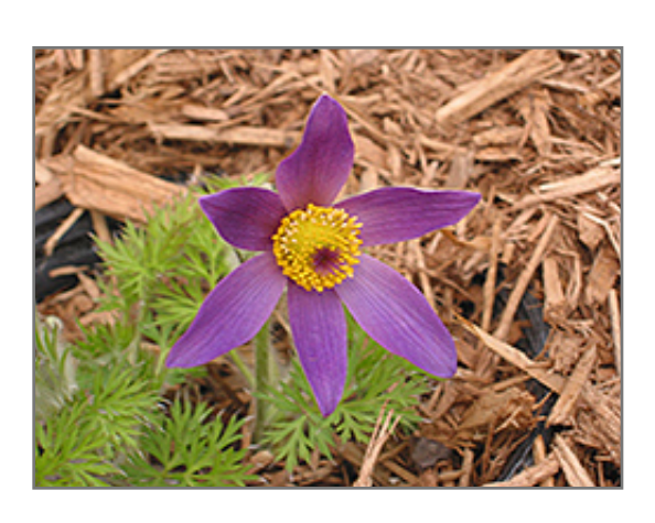
Papageno Pasqueflower flowers

Papgeno is a collection of fringed and semi-double flowers in shades of purple, pinks, reds, violets, blue and white that bloom in early spring over silvery fern-like foliage; frilly fruit are interesting through summer