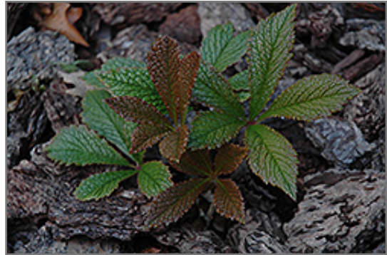
Firecracker Rodgersia in spring