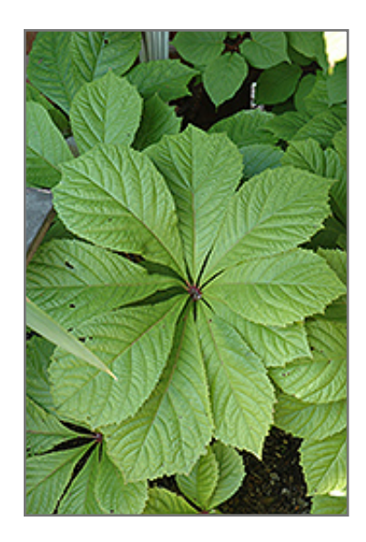
Chestnut Rodgersia