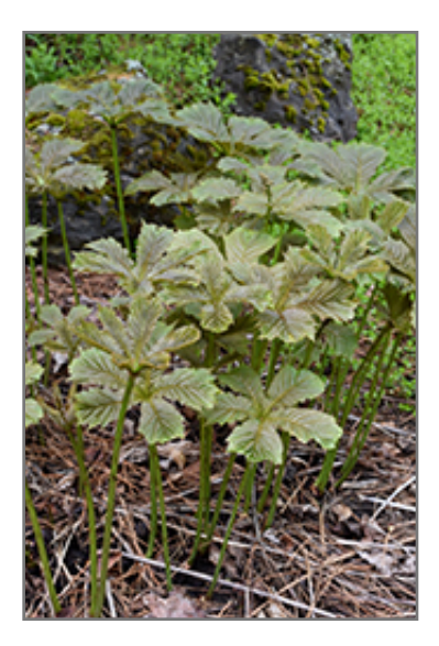
Chestnut Rodgersia

This plant does best in partial shade to shade. It prefers to grow in moist to wet soil, and will even tolerate some standing water. It is not particular as to soil pH, but grows best in rich soils. It is somewhat tolerant of urban pollution. Consider applying a thick mulch around the root zone over the growing season to conserve soil moisture. This species is not originally from North America. It can be propagated by division.