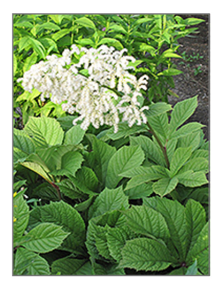
Chestnut Rodgersia flowers

Chestnut Rodgersia is recommended for the following landscape applications;