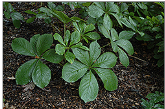
Pagoda Rodgersia foliage