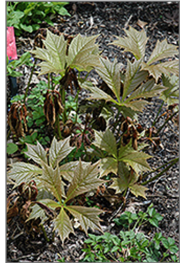
Bronzeleaf Rodgersia foliage