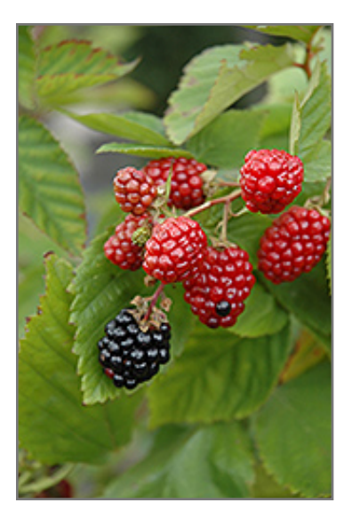
Black Satin Thornless Blackberry fruit

A thornless variety producing juicy crops through midsummer; blackberries are quite shrubby looking and require careful placement in the landscape, a specific pruning regimen and protection from birds