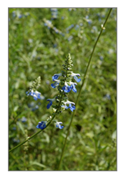
Bog Sage flowers

Bog Sage is an herbaceous perennial with tall flower stalks held atop a low mound of foliage. Its medium texture blends into the garden, but can always be balanced by a couple of finer or coarser plants for an effective composition.