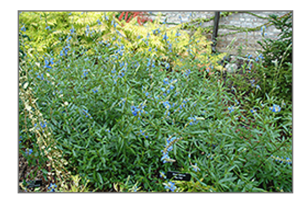
Bog Sage in bloom