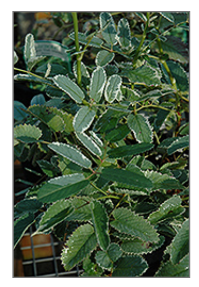
Dali Marble Burnet foliage