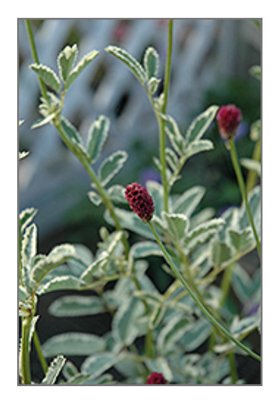
Dali Marble Burnet flowers

Dali Marble Burnet is recommended for the following landscape applications;