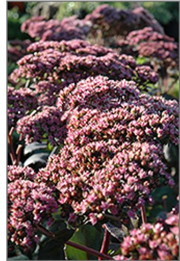
Maestro Stonecrop flowers

This is a relatively low maintenance plant, and is best cleaned up in early spring before it resumes active growth for the season. It is a good choice for attracting bees and butterflies to your yard, but is not particularly attractive to deer who tend to leave it alone in favor of tastier treats. It has no significant negative characteristics.