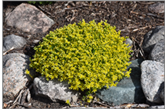
Golden Moss Stonecrop in bloom

Golden Moss Stonecrop is recommended for the following landscape applications;