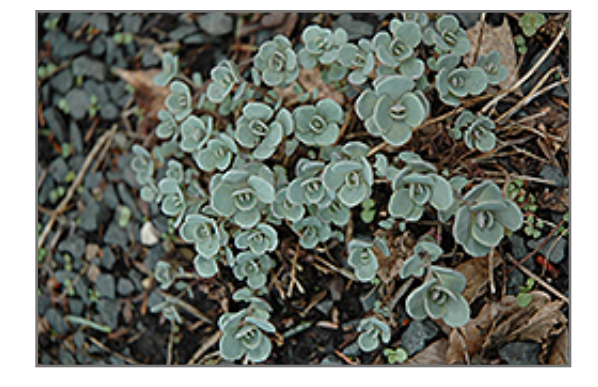
Purpurine Stonecrop foliage