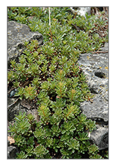
Middendorf Diffusum Stonecrop

A rare ground cover plant for the rock garden and vegetative (green) roof planting, forming a thick carpet of green with golden yellow flowers in early summer; foliage turns reddish in winter