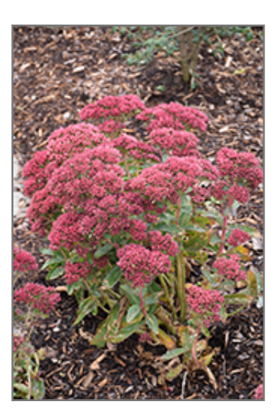
Munstead Dark Red Stonecrop in Photo courtesy of NetPS Plant Finder