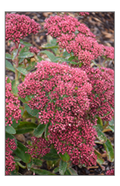
Munstead Dark Red Stonecrop flowers

Munstead Dark Red Stonecrop is recommended for the following landscape applications;