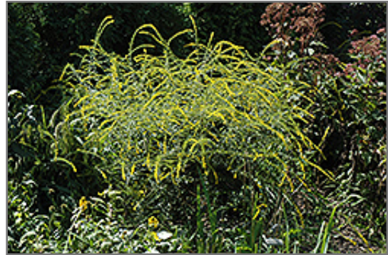
Fireworks Goldenrod in bloom