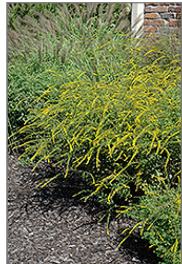
Fireworks Goldenrod flowers