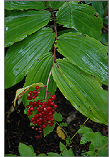
False Solomon's Seal fruit

False Solomon's Seal is primarily grown for its highly ornamental fruit. It features an abundance of magnificent red berries from late summer to early fall. It has masses of beautiful panicles of creamy white flowers at the ends of the stems from mid to late summer, which are most effective when planted in groupings. Its oval leaves remain forest green in colour throughout the season.