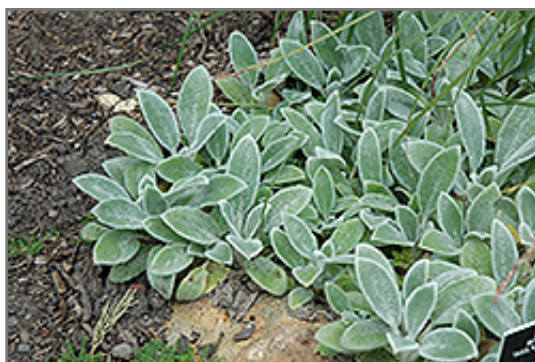
Silver Carpet Lamb's Ears