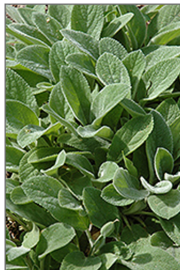
Silver Carpet Lamb's Ears foliage