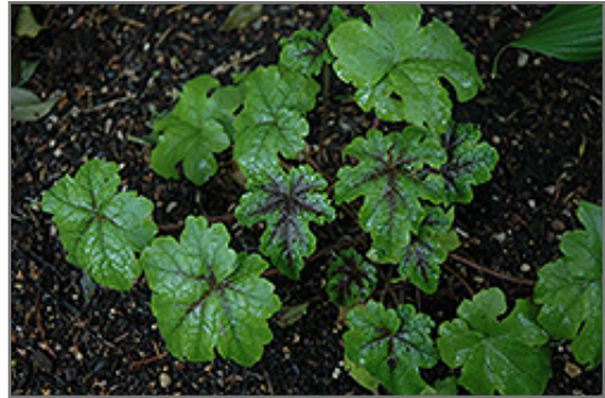
Jeepers Creepers Foamflower flowers