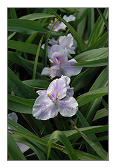
Little White Doll Spiderwort flowers

Little White Doll Spiderwort has masses of beautiful clusters of white flowers at the ends of the stems from early to late summer, which are most effective when planted in groupings. Its grassy leaves remain green in colour throughout the season.