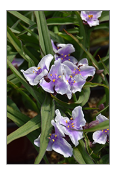
Bilberry Ice Spiderwort flowers

Bilberry Ice Spiderwort has masses of beautiful clusters of white flowers with lavender overtones at the ends of the stems from early to late summer, which emerge from distinctive purple flower buds, and which are most effective when planted in groupings. Its grassy leaves remain green in colour throughout the season.