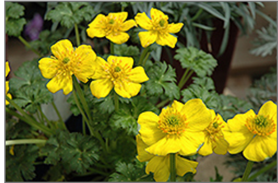
Dwarf Globeflower flowers