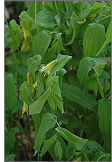
Great Merrybells flowers