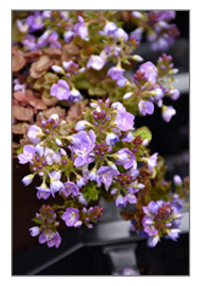
Crystal River Speedwell flowers

This plant does best in full sun to partial shade. It prefers dry to average moisture levels with very well-drained soil, and will often die in standing water. It is considered to be drought-tolerant, and thus makes an ideal choice for a low-water garden or xeriscape application. It is not particular as to soil type or pH. It is highly tolerant of urban pollution and will even thrive in inner city environments. This particular variety is an interspecific hybrid. It can be propagated by division; however, as a cultivated variety, be aware that it may be subject to certain restrictions or prohibitions on propagation.