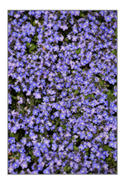
Crystal River Speedwell flowers