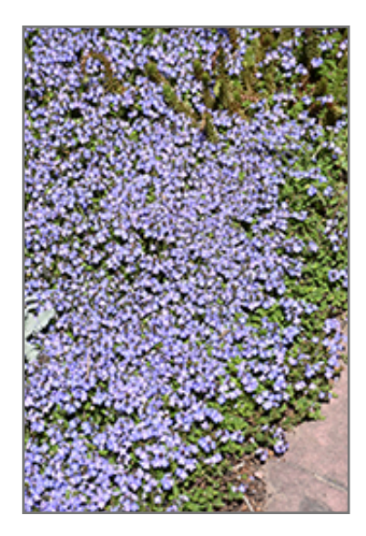
Crystal River Speedwell in bloom