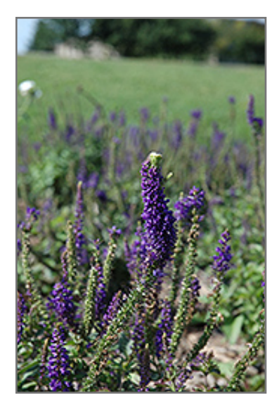
Total Eclipse Dwarf Speedwell flowers

Total Eclipse Dwarf Speedwell has masses of beautiful spikes of indigo flowers with violet overtones rising above the foliage from early to mid summer, which are most effective when planted in groupings. The flowers are excellent for cutting. Its glossy narrow leaves remain green in colour throughout the season.