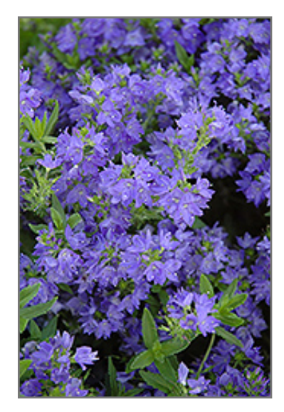
Trehane Creeping Speedwell flowers

Trehane Creeping Speedwell is a dense herbaceous perennial with a ground-hugging habit of growth. Its relatively fine texture sets it apart from other garden plants with less refined foliage.