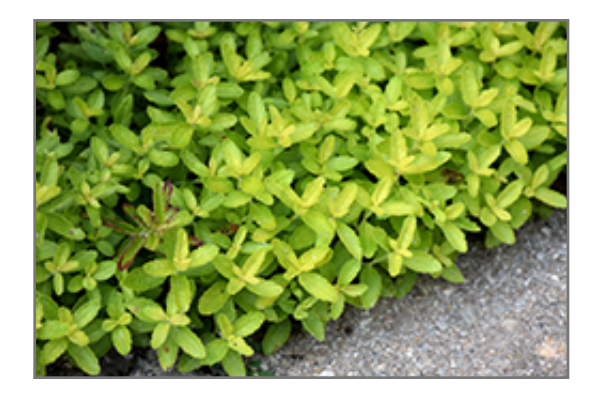
Trehane Creeping Speedwell

This is a relatively low maintenance plant, and should only be pruned after flowering to avoid removing any of the current season's flowers. It is a good choice for attracting butterflies to your yard, but is not particularly attractive to deer who tend to leave it alone in favor of tastier treats. It has no significant negative characteristics.