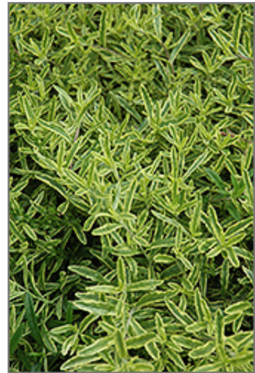
Goldwell Creeping Speedwell foliage

This plant will require occasional maintenance and upkeep, and should only be pruned after flowering to avoid removing any of the current season's flowers. It is a good choice for attracting butterflies to your yard, but is not particularly attractive to deer who tend to leave it alone in favor of tastier treats. It has no significant negative characteristics.