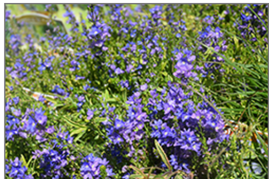
Goldwell Creeping Speedwell flowers