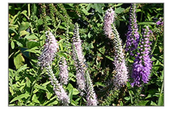
Fairy Tale Speedwell flowers

Fairy Tale Speedwell is recommended for the following landscape applications;